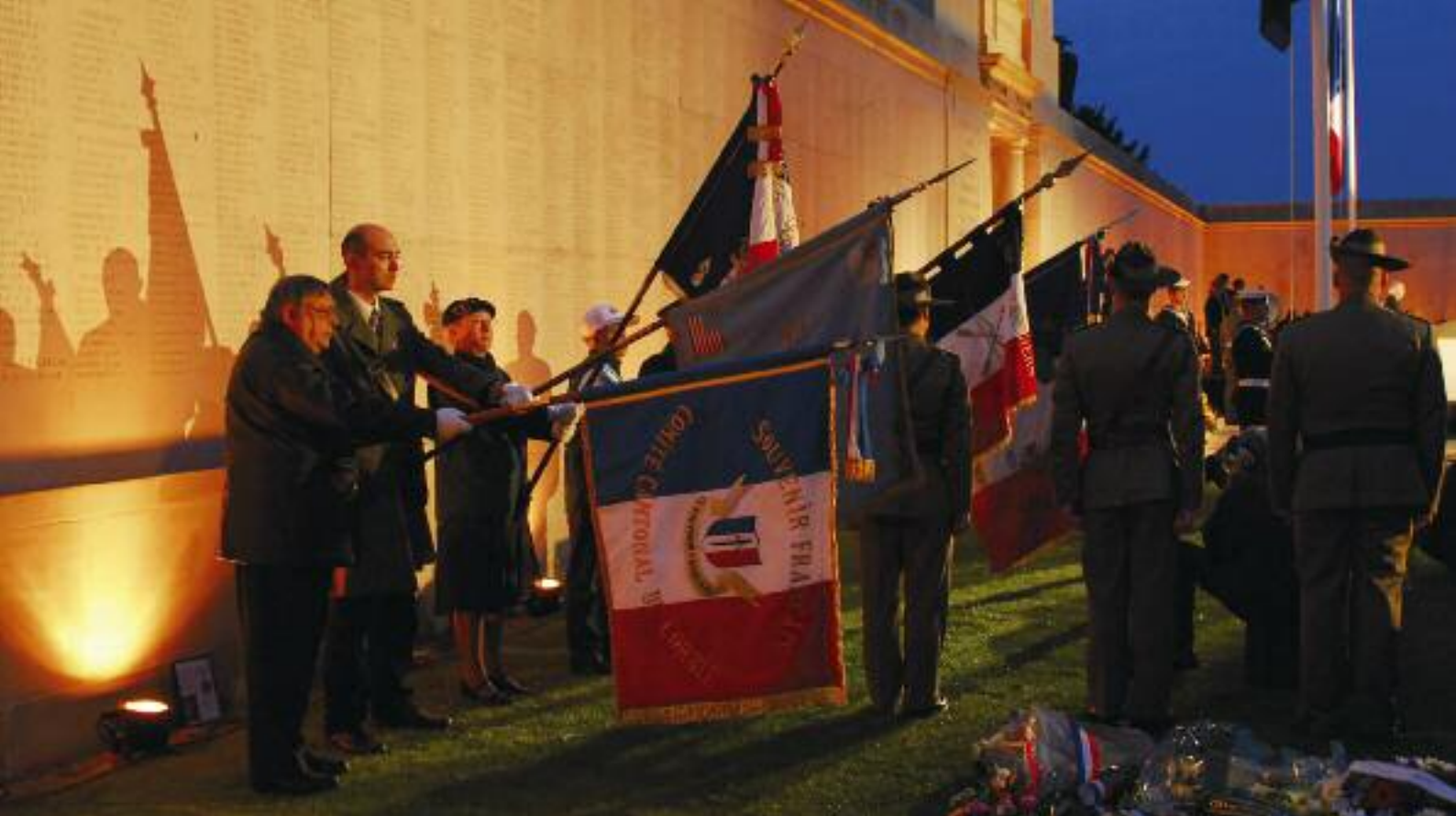
Dawn Service Villers-Bretonneux

happened in this area east of Ypres in 1917 was eventually summed up in one terrible word - Passchendaele! (B)