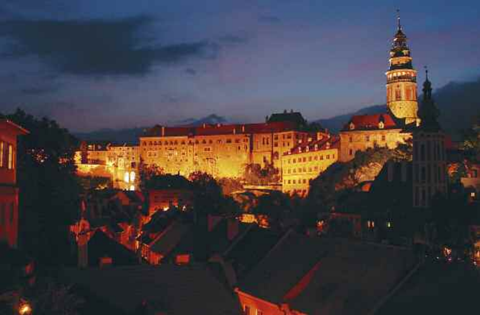
Cesky Krumlov by night

Prague boulevard Wenceslas Square. (B, D)