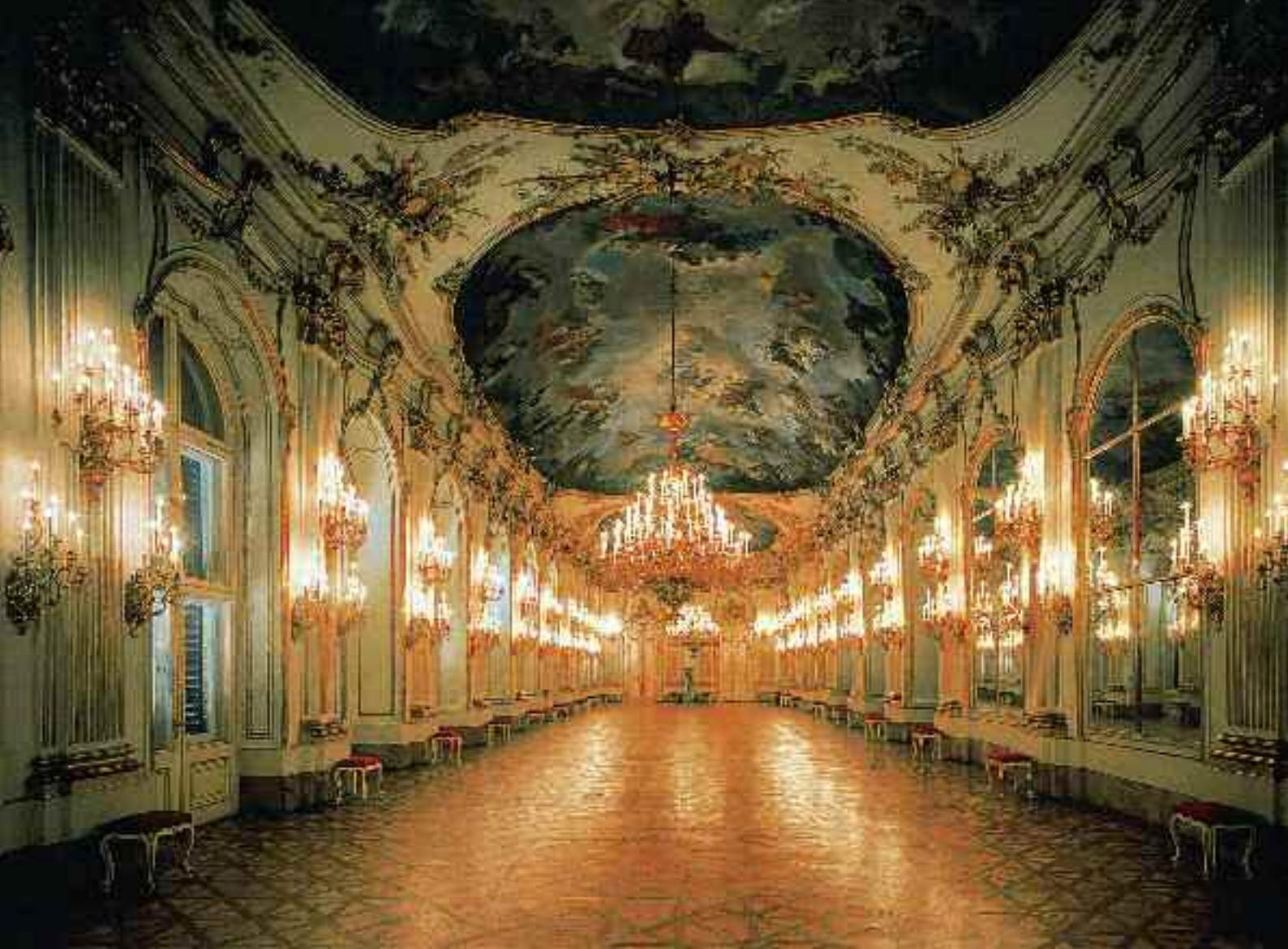
Schonbrunn Palace, Vienna

we have included the services of a local guide to bring to life the history and background of this extraordinary town and castle.