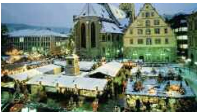
Stuttgart Christmas Markets

Your Black Forest Hotel – Hotel Schloss Hornberg. Enjoy the 900 years of history surrounding your little 'schloss' (stately home) which boasts Black Forest traditions and culinary delights. (technically 'schloss' means palace or castle however the Hornberg is better described as a stately home or mansion). Situated in a beautiful park above the valley in the heart of the Black Forest, this location makes an excellent base for all of our included excursions to the surrounding areas. This traditional hotel oozes charm. It has a 3 star classification and all guestrooms are fitted with bath/showers, radio, telephones and satellite television. Please note the Hornberg Hotel has no lift however our rooms will be located on floors 1 and 2. The hotel web site is written in German but you still may wish to have a look. Go to www.schloss-hornberg.de