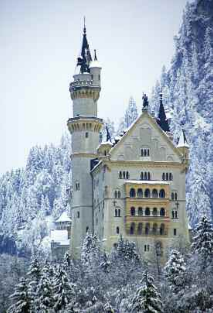
Neuschwanstein above your New Year Village