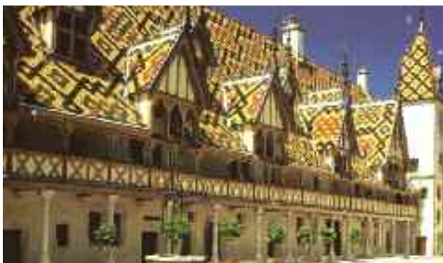
The Hospices de Beaune

This morning we travel towards Paris via the Forest and Chateau of Fontainebleau. Dating back 800 years this wonderful Chateau has been remodelled by various French Kings throughout the centuries in both Roman and Florentine styles. The grand apartments of this royal residence (entrance included) are truly splendid. This afternoon we arrive in Paris