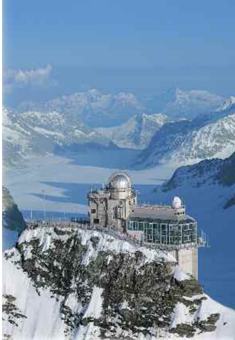
Top of the Jungfrau