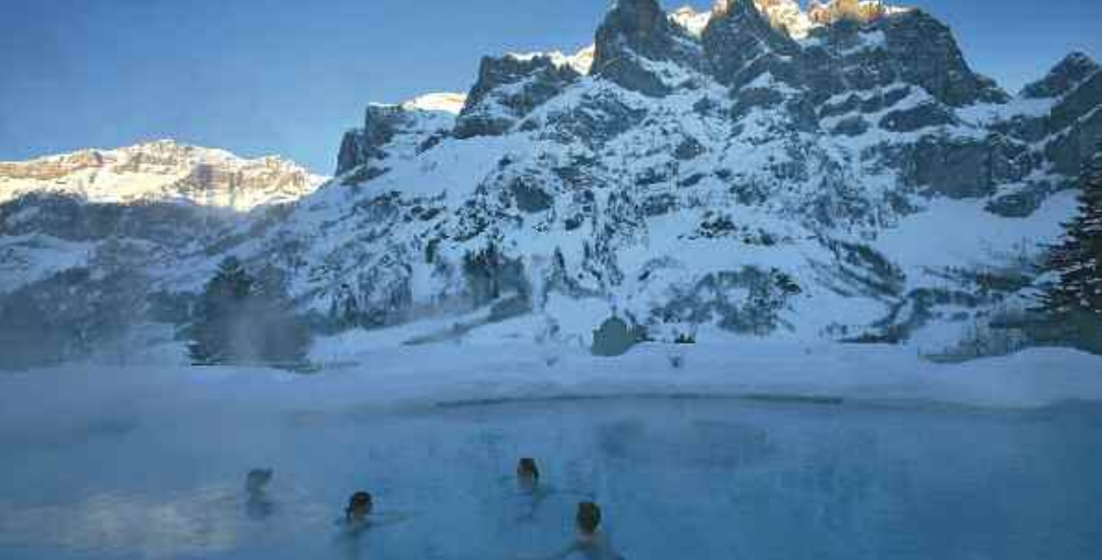
Leukerbad – Lindner Hotel Alpentherme