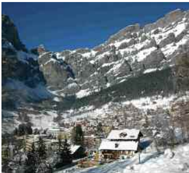
Leukerbad - Your Christmas Village

This morning we make our way to the German border and to the banks of Lake Bodensee (Constance). Here we stop at the beautifully preserved island town of Lindau, Germany's southern most city, complete with medieval lighthouses and cobbled stone streets. This afternoon we will go to Neu St Johann to enjoy a delightful horse drawn sleigh ride followed by dinner in your hotel. (B, D)