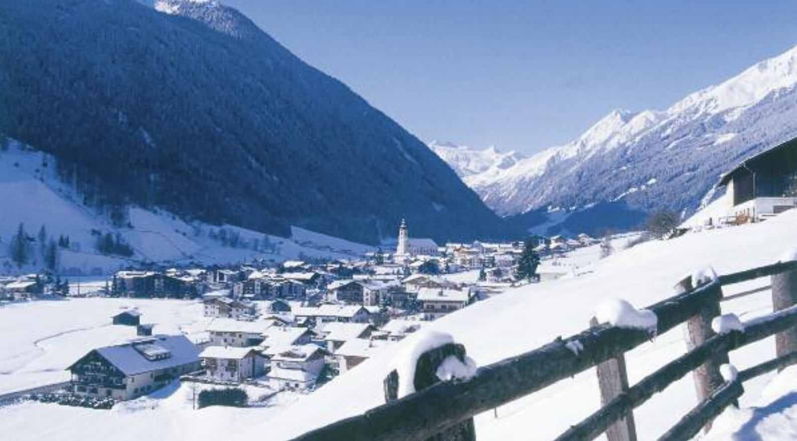
Neustift – Your Christmas Village

along the broad Inn Valley are magnificent, and standing at the jumper's start point looking down the steep ramp is spine-tingling. Later, we continue the short distance to the winter resort of Innsbruck where we spend the afternoon exploring the Old Town. Make sure you enjoy the picture perfect Christmas Markets in the old medieval square beneath the famous 'Golden Roof'. Fifty metres away from this historic landmark is the Goldener Adler hotel and restaurant where we will also enjoy an early evening dinner. (B, D)