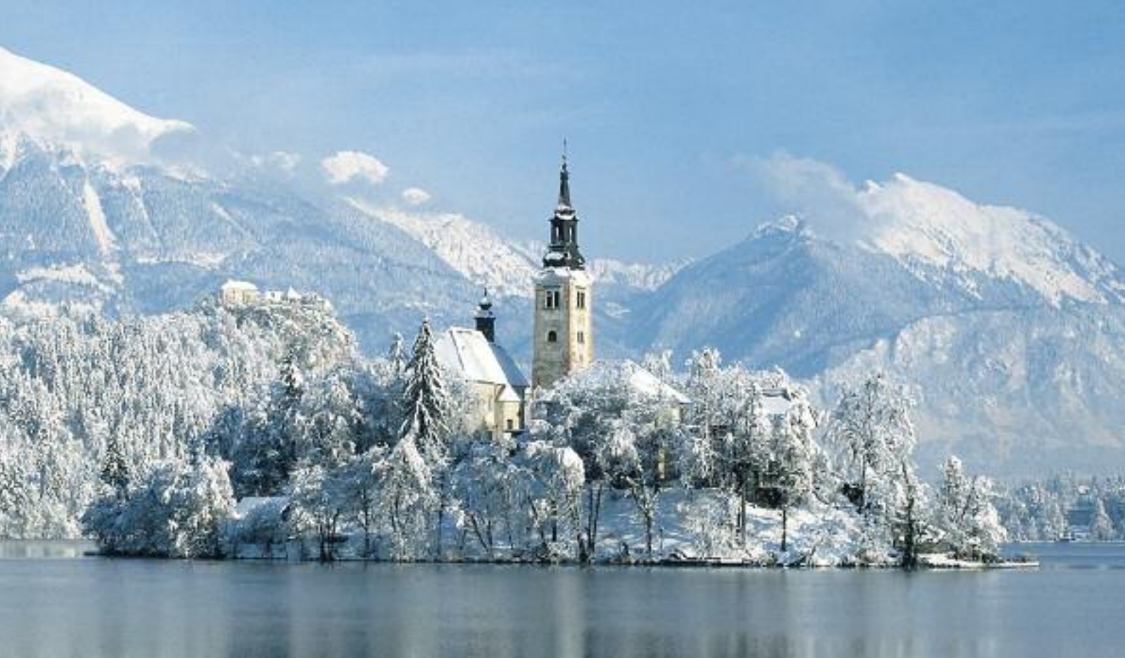
Enjoy your Christmas by Lake Bled

where we join our expert local guide for a walking tour. The rest of the day is free to shop and explore the myriad of narrow, water lined streets and canals spanned by humped back bridges. Dinner this evening is back in 'our' castle. (B, D)