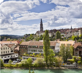
Bern Explore this UNESCO World Heritage Site