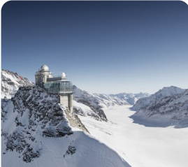
The Jungfrau 'Top of Europe' Experience