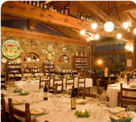
Redaelli de Zinis Wine Tasting & Lunch

Correct as of 20:28 on 03rd September 2025