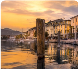
Lake Garda Enjoy 'My Time'