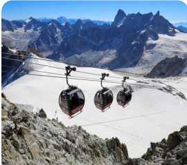
Aiguille du Midi Cable Car

These are just a few of the very special hand selected experiences that will really make your touring experience exceptional and unique, and don't forget, with Albatross they are always included.