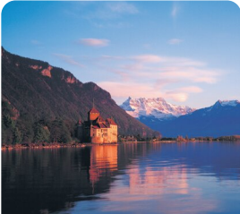
Chateau Chillon Guided Tour