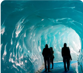
'Mer du Glace' France's Largest Glacier