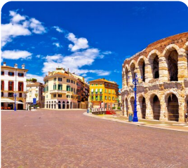
Visit Verona Guided Walking Tour