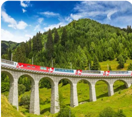
Ride the Glacier Express Panoramic Train