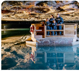
Salt Mines Berchtesgaden