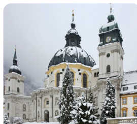
Kloster Ettal Monastery