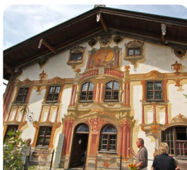
Oberammergau Traditional Bavarian Village