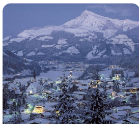
Kirchberg in the Tyrol A Festive 7 night Christmas Stay

These are just a few of the very special hand selected experiences that will really make your touring experience exceptional and unique, and don't forget, with Albatross they are always included.