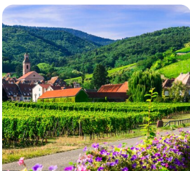
Alsace Wine Road Wine Tasting

These are just a few of the very special hand selected experiences that will really make your touring experience exceptional and unique, and don't forget, with Albatross they are always included.