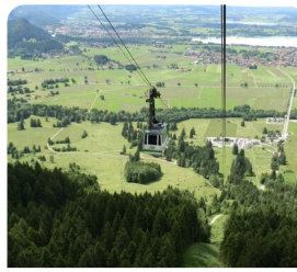
Tegelberg Cable Car Ride