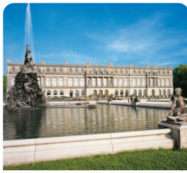
Herrenchiemsee Palace Guided Visit