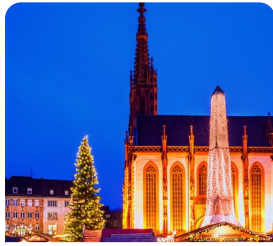
Würzburg Christmas Markets

These are just a few of the very special hand selected experiences that will really make your touring experience exceptional and unique, and don't forget, with Albatross they are always included.