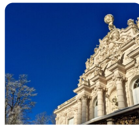
Linderhof Palace Guided Tour