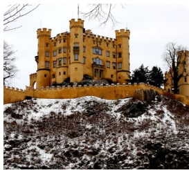
Hohenschwangau Castle Guided Tour