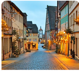
Rothenburg Night Watchman Walking Tour