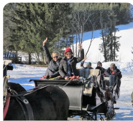
Horse and Carriage Ride Through the Local Countryside