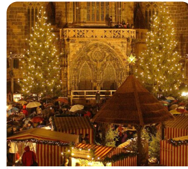
Nürnberg Christmas Markets