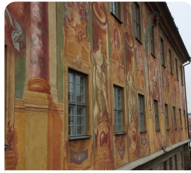
Bamberg UNESCO World Heritage Site