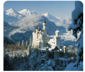
Neuschwanstein Castle Fairytale Castle of 'Mad' King Ludwig