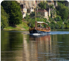
Dordogne Sarlat & La Roc Gageac