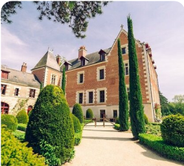
Amboise Da Vinci's Residence