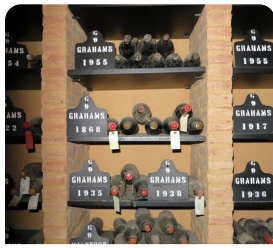
Porto Port Wine Tasting