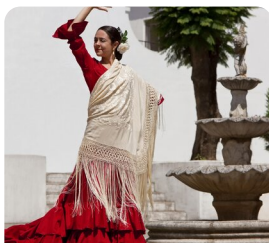
Seville Flamenco Dance Lesson