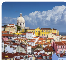
Lisbon Guided City Tour