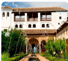
Granada The Incredible Alhambra