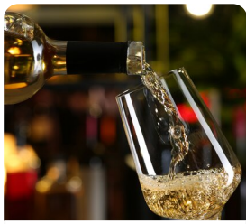
Aveleda Wine Estate Wine Tasting