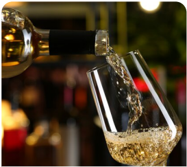
Aveleda Wine Estate Wine Tasting