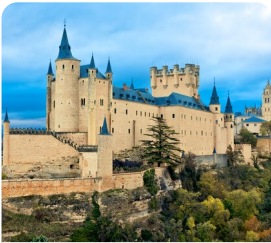
Segovia Guided Walking Tour

Correct as of 05:33 on 16th January 2026