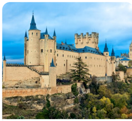
Segovia Guided Walking Tour