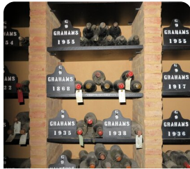
Porto Port Wine Tasting