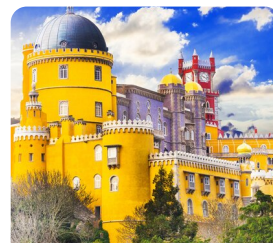
Sintra Palace de Pena