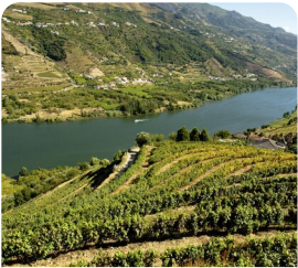
Douro River Scenic Lunch Cruise