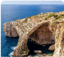
Hagar Qim & The Blue Grotto Ancient Temples & a Boat Cruise