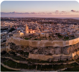
Island of Gozo Victoria Citadel and Xlendi