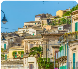
Modica Cioccolato di Modica