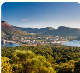
Vulcano Panoramic Drive