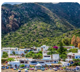
Panarea and Stromboli Afternoon Cruise & Evening 'Stromboli Fireworks'