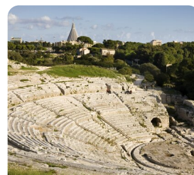
Syracuse & Ortigia Ancient Ruins & a Historical Centre